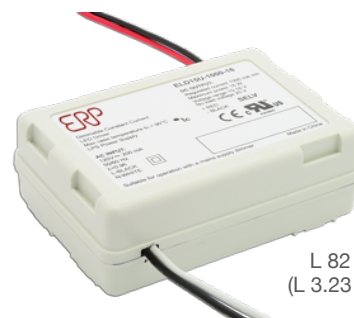
Plastic Case L 82 x W 56 x H 29 mm (L 3.23 x W 2.20 x H 1.14 in)