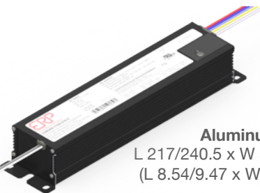
Aluminum Case L 217/240.5 x W 50.8 x H 38.5 mm (L 8.54/9.47 x W 2.00 x H 1.52 in)

For additional options of output current and output voltage, contact your sales representative or send an email to: SaveEnergy@erp-power.com