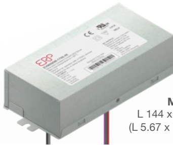
Metal Case L 144 x W 70 x H 40 mm (L 5.67 x W 2.76 x H 1.57 in)